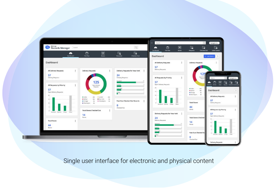
Single user interface for electronic and physical content

buildings, offices, file rooms, zones, racks, shelves, and other specific locations